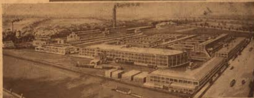
Crescentville Plant Philadelphia