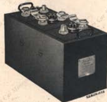
A Typical Exide Truck Battery TYPE LXRE

This record of achievement is based upon a continuing practice of producing a uniformly high quality battery. In the building of Exide starting batteries for automobiles it is the aim to consistently meet every requirement of maximum cranking ability, long life and dependability, with low cost to the user.