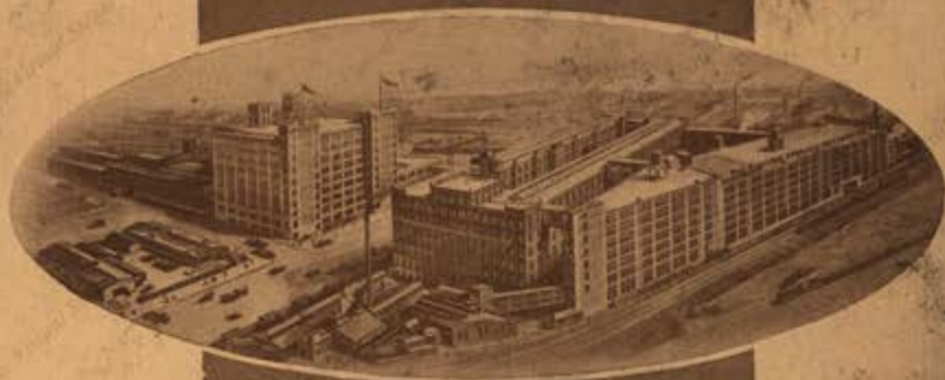
General Offices and Works Allaigheny Ave and 11th St Philadelphia

World's largest manufacturers of Storage Batteries for every purpose