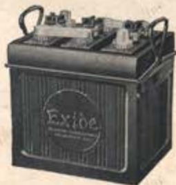
An Exide Battery for Automobile Starting, Lighting and Ignition TYPE XCR

This is the organization that is behind the Exide Starting and Lighting Battery—an organization whose wide experience, whose broad policies and whose co-operation with its customers, have made it the dominating figure in the storage battery industry.