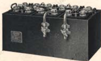
A Typical Exide Battery for Motor-Coach Service TYPE KXX

*For the Wills-St. Claire a special assembly of type 3-XXV-19-2 is recommended. By reversing the position of the covers on the standard assembly of this battery it is made possible to properly install the battery with the positive terminal toward the engine and yet have the vent plugs accessible for testing.